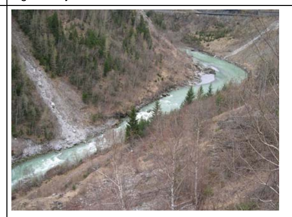
Inn, downstream of Martina, current hydropeaking - , future minimum flow section