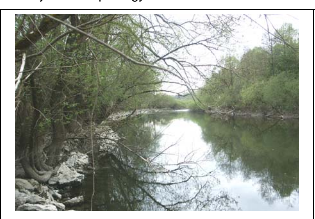
Diverted Reach, River Danube: Backwater, waterdepth up tu 3 m, low flow velocity

The model system CASiMiR has been applied within the scope of many projects with different investigation focuses and with different types and levels of flow as well as on different river types and dimensions reaching form high alpine creeks to large lowland rivers. Same as for conventional hydraulic modeling information on river bathymetrie and bottom roughness is required for the application of the habitat model. Therefore it is supposed that cross section survey can be performed either by wading the river during low flow, by crossing it with a boat or by installing any other device to detect river geometry and morphology.